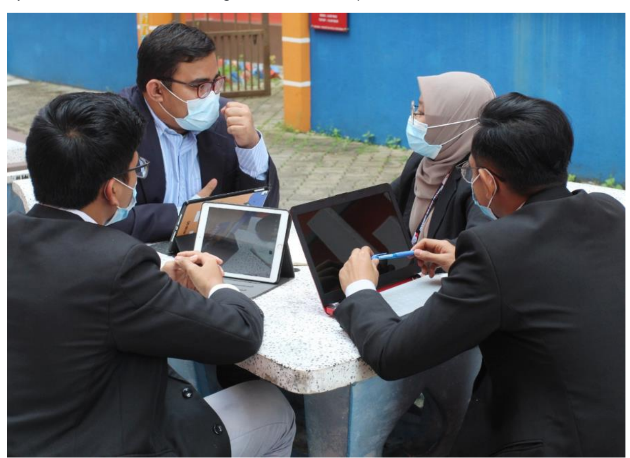
RM35 million will be used to improve Internet access at all public universities under the Malaysian Research & Education Network programme.

THE RM55.2 billion allocated for the Education Ministry (MoE) and RM15.3 billion for the Higher Education Ministry (MoHE) in this year's 2023 Budget reflected the unity government's priority towards education.