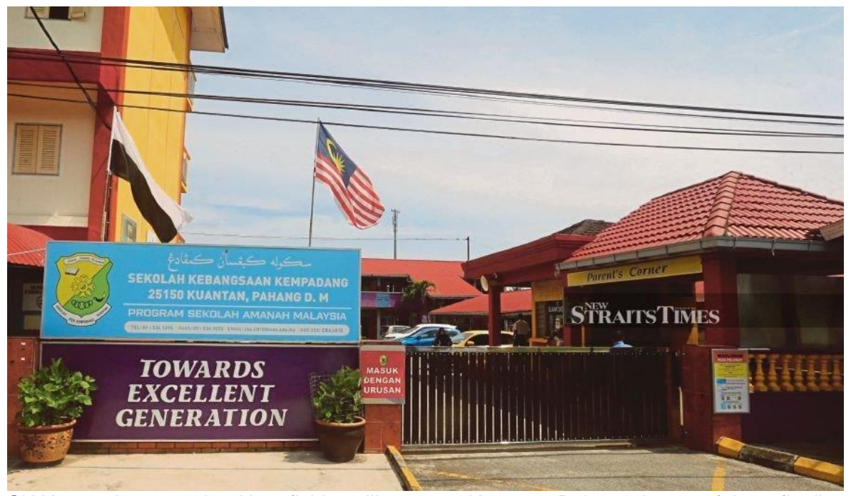
SK Kempadang, a school in a fishing village near Kuantan, Pahang, is one of three finalists for the World's Best School Award.